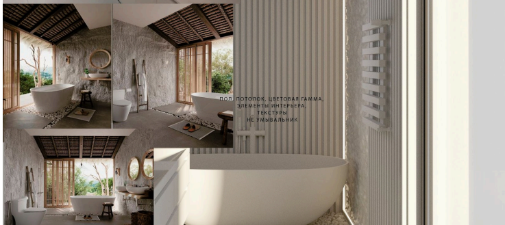
ПОД ПОТОЛОК, ЦВЕТОВАЯ ГАММА, ЭЛЕМЕНТЫ ИНТЕРЬЕРА, ТЕКСТИЛЬ, НЕ УМЫВАЛЬНИК