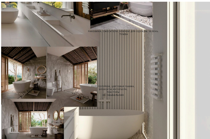
РАКОВИНА, СМЕСИТЕЛИ, КРЯЧКИ ДЛЯ ОДЕЖДЫ, ЗЕЛЕНЬ, ТУМБА