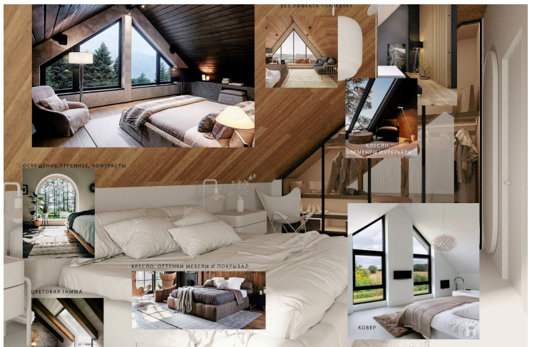
ОСВЕЩЕНИЕ УТРАННЕЕ, КОНТРАСТЫ