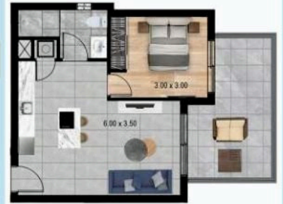
Flat 102 / 202* / 302