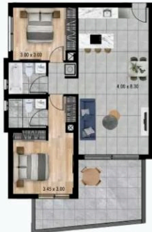
Flat 102 / 202* / 302