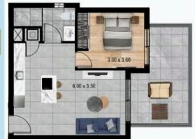
Flat 105 / 205 / 305