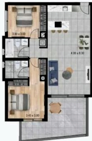
Flat 102 / 202* / 302