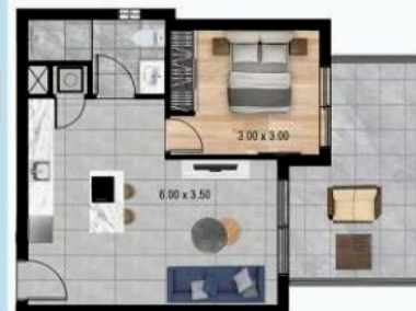
Flat 105 / 205 / 305