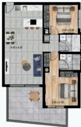
Flat 104 / 204* / 304