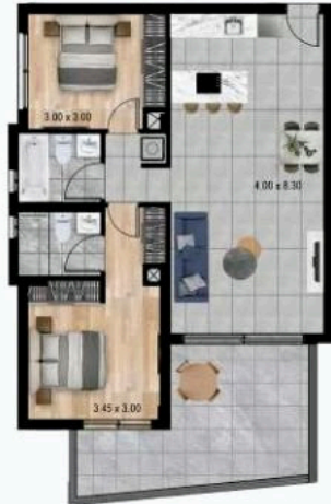
Flat 102 / 202* / 302