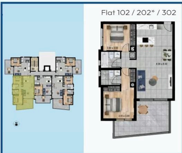
Flat 102 / 202* / 302