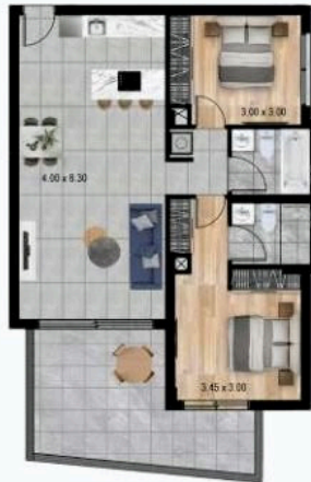
Flat 105 / 205 / 305