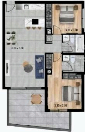
Flat 105 / 205 / 305