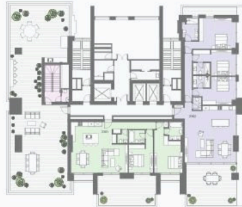
23 RD FLOOR