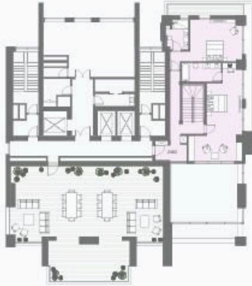
25 TH FLOOR