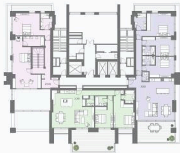
22 ND FLOOR