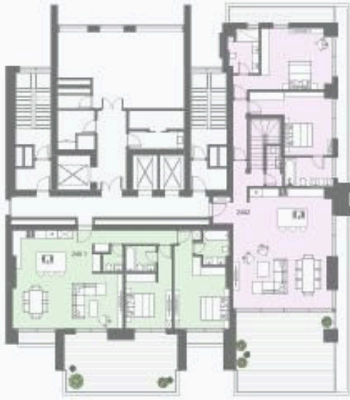
24 TH FLOOR