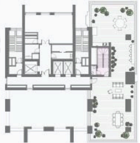
26 TH FLOOR