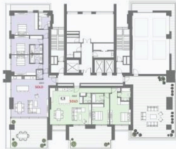
20 TH FLOOR